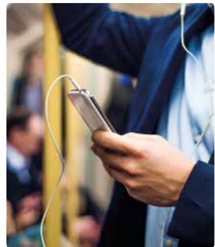
The best apps have been clinically tested.

The best apps have been clinically tested, so buyers who carefully research their purchases can make an informed choice. Other than from app providers, there have been few studies into the effectiveness of mindfulness apps that could be considered methodologically acceptable by the research community. However, one recent example gives grounds for optimism that they can make a meaningful difference if used regularly . 4 As ever, more studies are needed.