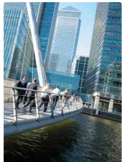
The launch event was held at the bank's Canary Wharf HQ.

In September 2017, HSBC received a Parliamentary award in recognition of the achievements of the mindfulness network. Following this success, colleagues from other parts of the world have contacted them for support in setting up their own networks.