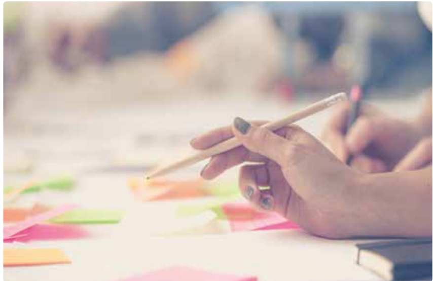
Mindfulness has proven benefits for building resilience and wellbeing.

Large numbers of employees will take up the practice.